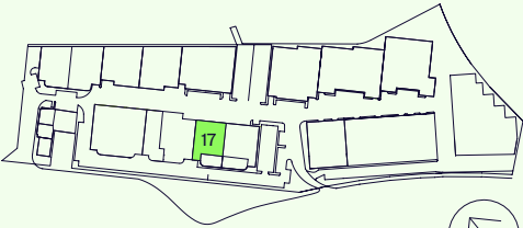
LOCATION PLAN NOT TO SCALE