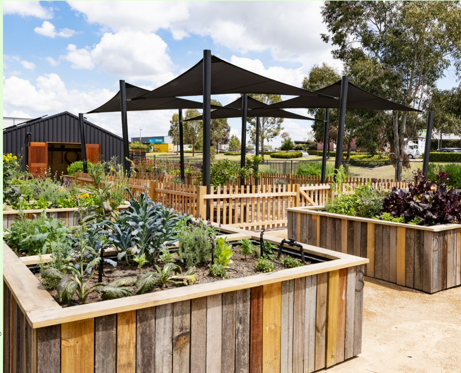
Sustainable garden at Eastern Creek