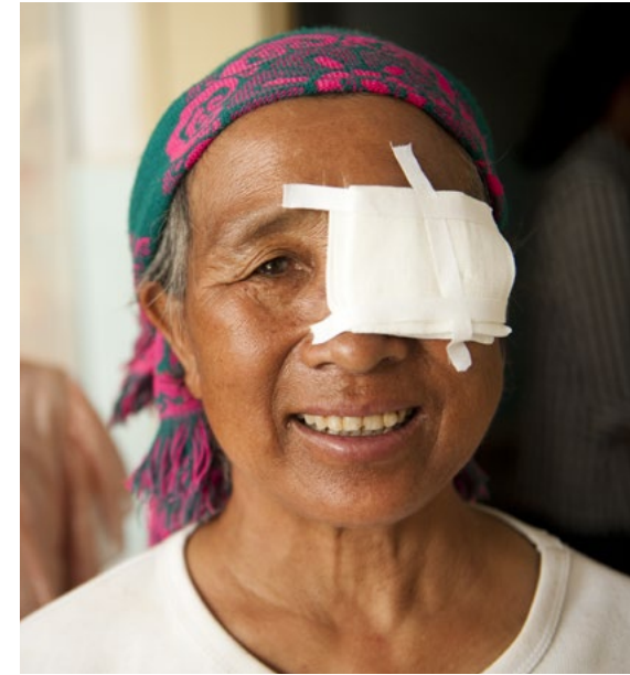
L-R: Good360, OzHarvest, The Fred Hollows Foundation

In 2021, the Goodman Foundation contributed $6.3 million to community and philanthropic causes including $400,000 raised directly by Goodman staff.