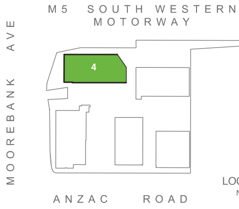
LOCATION PLAN NOT TO SCALE