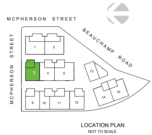
LOCATION PLAN NOT TO SCALE