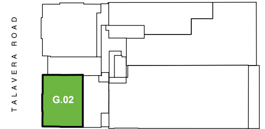
Location Plan Not To Scale