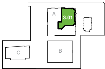
Location Plan Not to Scale